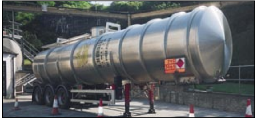
WITH THANKS TO GEFCO UK

Initially there was a voluntary code of practice and this was incorporated into ADR 2005 and as a result became part of the UK Carriage Regulations. The Regulations set out duties at two levels, the lowest level – which applies to any vehicle displaying orange plates – requires drivers to carry photo ID and anyone involved to have awareness training. At the higher level of 'High Consequence Dangerous Goods' – which includes such things as large quantities of explosives, tankers of flammable liquids and goods of packing group one – a further full risk assessment and emergency